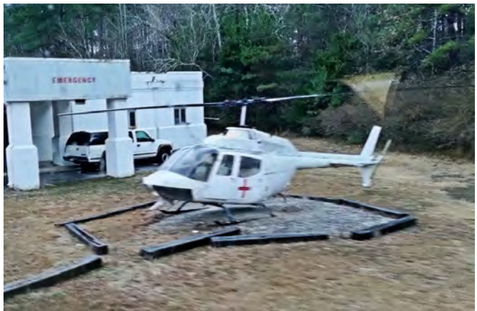
Our tour included a review of mock villages for training explosive detection teams in realistic infrastructure