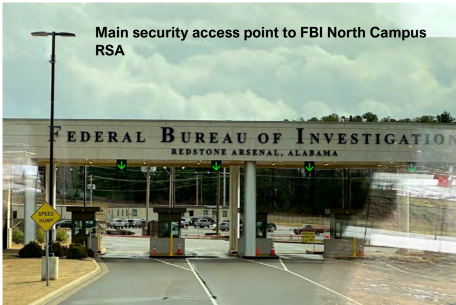
Main security access point to FBI North Campus RSA

The FBI Ballistic Research Facility / BRF , an independent research facility has created a body armor test protocol to ensure, that the vests issued to FBI personnel perform at the highest level possible. Key facts of this test protocol are included in this public link : FBI Body Armor Test Protocol