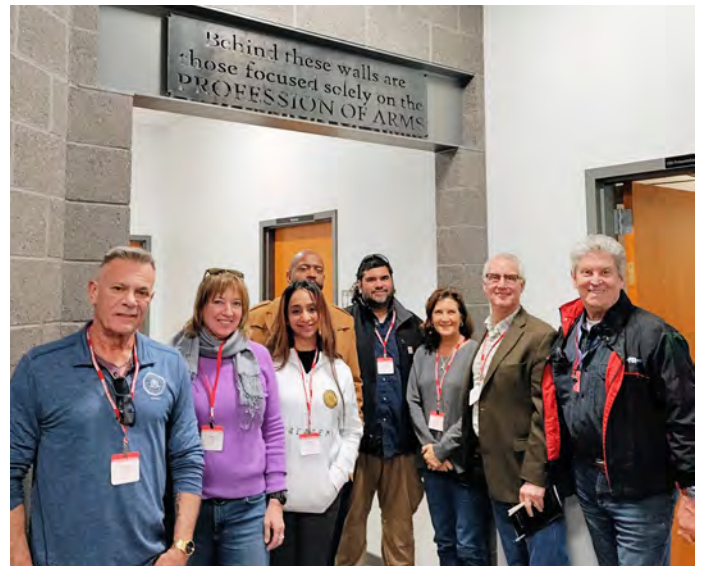
Our group wraps up our FBI tour in the main entry of the BRF / Ballistic Research Facility ...